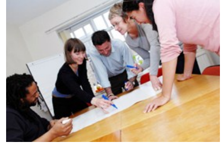
JC Higgins & Associates-check them out at http://jc-higgins.com/services.php

The Morningview Ridge Board members have selected a management company to handle all annual dues and property transactions. Since the board is a volunteer staff, it has taken countless hours to manage books and keep up with monthly statements. Please welcome JC Higgins & Associates to the table.